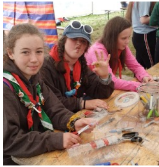
'Fish you were here': Irish Girl Guides