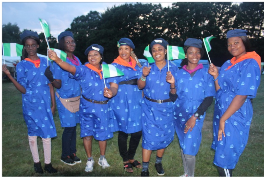
Best of luck to Nigeria on their Centenary Celebrations, Lagos, 17-24th August: www.nigeriangirlguides.org/centenary-celebrations