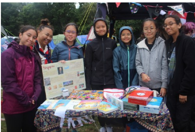
Singapore Guides sharing their resources at Open Day