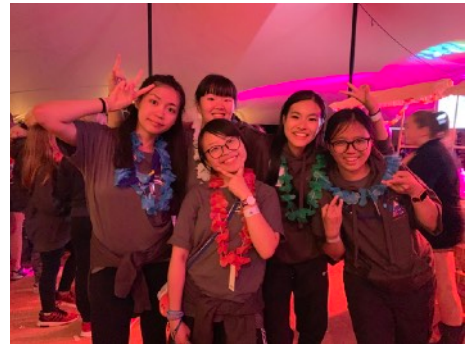
Rave in the Wave! Hong Kong get in the beach party mood