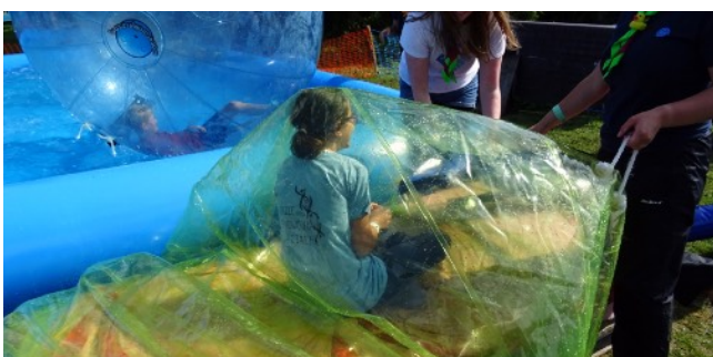
A Greek Guide going zorbing!

England, Caribbean united as one When we're together it's nothing but fun Not strangers but sisters though we've only just met An unbreakable bond? We just don't know yet. Pink Flamingos together through thick and through thin Never a dull moment, where do I even begin? From breakfast to dinner, in sunshine and rain By the end of camp Olave, new sisters we'll gain - St Vincent and The Grenadines Paige, Jeshari, Breana, Tiyana, Tamika and Taylor