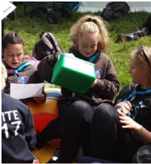
Our Australian Ranger wishes she had this boat yesterday!