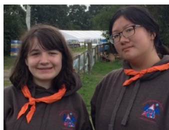
Girl Scouts from the US

Guides have been busy badge swapping at the Pier Cafe in the evenings as part of Sun and Stars. You'll have lots of new international badges and stories to share.