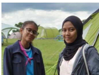
Malaysian Guides ready for activities