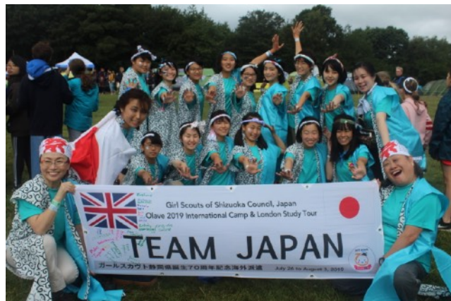
ようこそ日本 and thank you for your amazing dance!